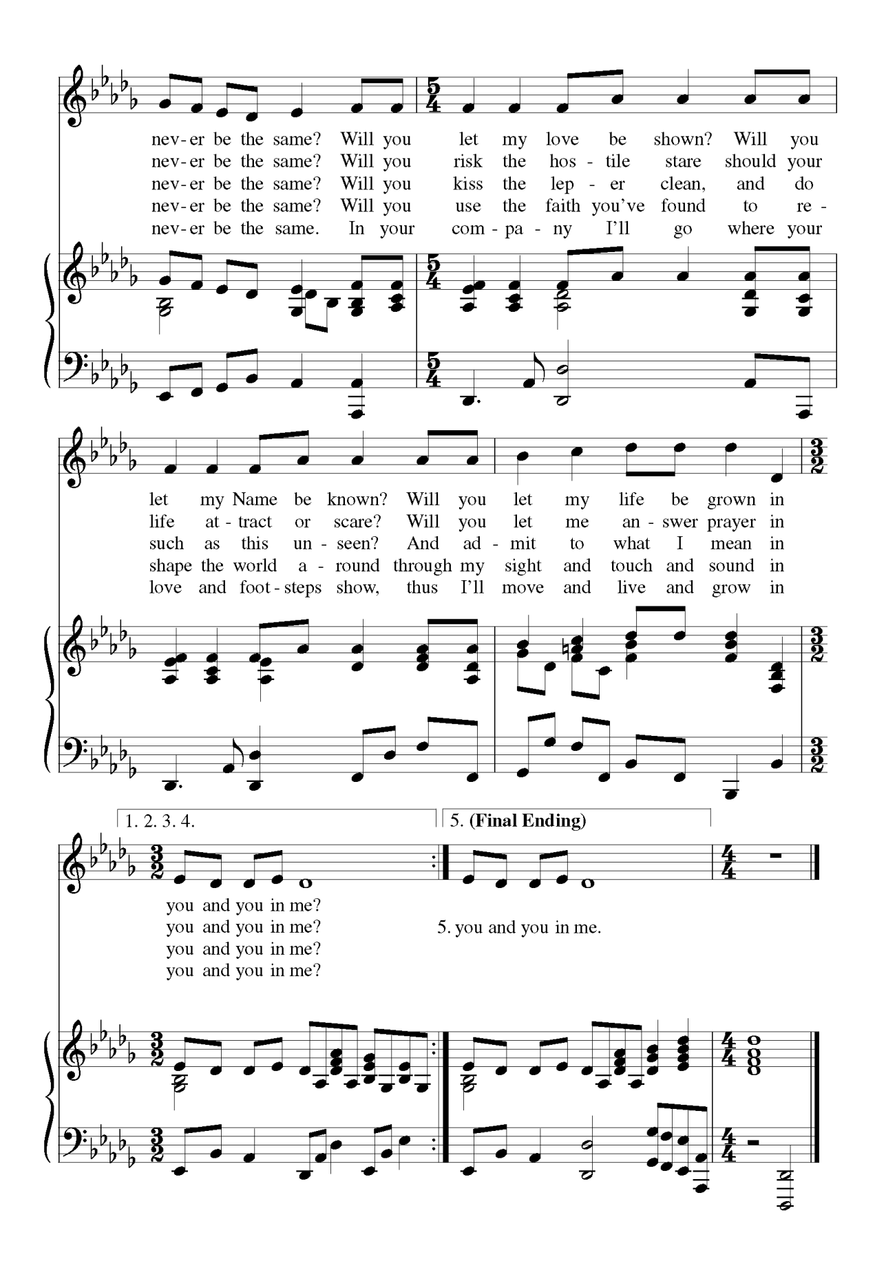
Long ago God spoke to our ancestors in many and various ways by the prophets, but in these last days God has spoken to us by the Son.